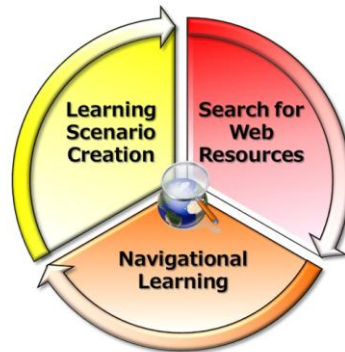
Figure 1. Model of Web-based Investigative Learning Process

We have proposed a model of investigative learning with Web resources as shown in Figure 1, which includes three cyclic phases: (a) search for Web resources, (b) navigational learning, and (c) learning scenario creation (Kashihara and Akiyama 2013, Kinoshita and Kashihara 2013).